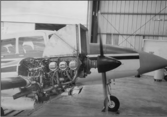
Example: Run-in using cooling shroud

addition to the risk due to test flying, overheating the engine on the ground must be considered by the overhauler/installer. In some cases of extreme engine overheating, the pistons will expand to a diameter larger than the cylinder bore, and will result in severe scoring. Overheating of the cylinder barrel during run-in is not always indicated on cylinder head temperature gauges before the damage has been done because the thermocouple is on the head rather than the barrel. Improper ring seating causes increased blow-by which heats the internal components of the engine and the oil supply. Prolonged operation with excessive blow-by can cause premature failure of cam followers and camshaft lobes.