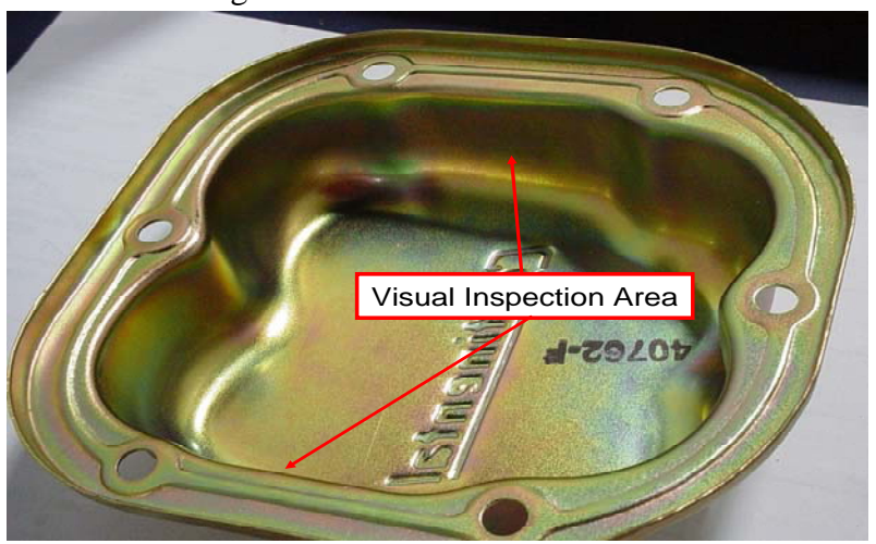
FIGURE 3 ROCKER COVER INSPECTION

5) If the P/N 654375 Rocker Shaft was installed, inspect each Rocker Cover for chafing in the areas as indicated in Figure 3. If damage in the form of metal removal is found, the Rocker Cover must be replaced with a new P/N 40762 Rocker Cover. Acceptable wear pattern is shown in Figure 4.