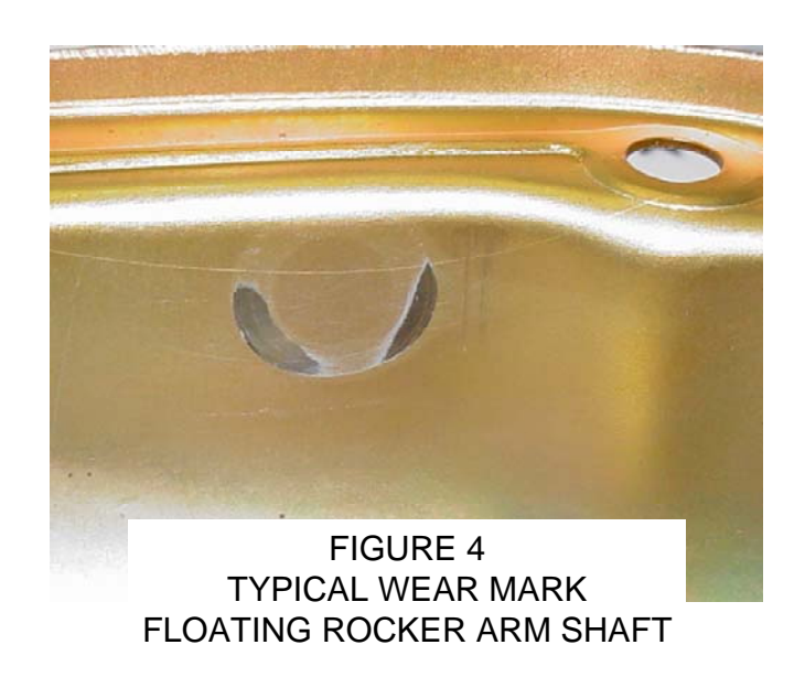
NOTE: A wear mark on the Rocker Cover is normal when utilizing a floating Rocker Shaft such as the P/N 21153 and is not an indicator for Rocker Cover replacement.