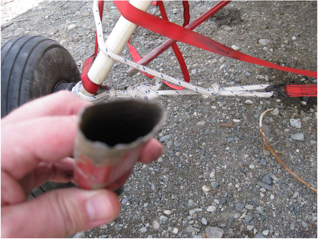
Broken End of Tie Strut (Removed from Aircraft)