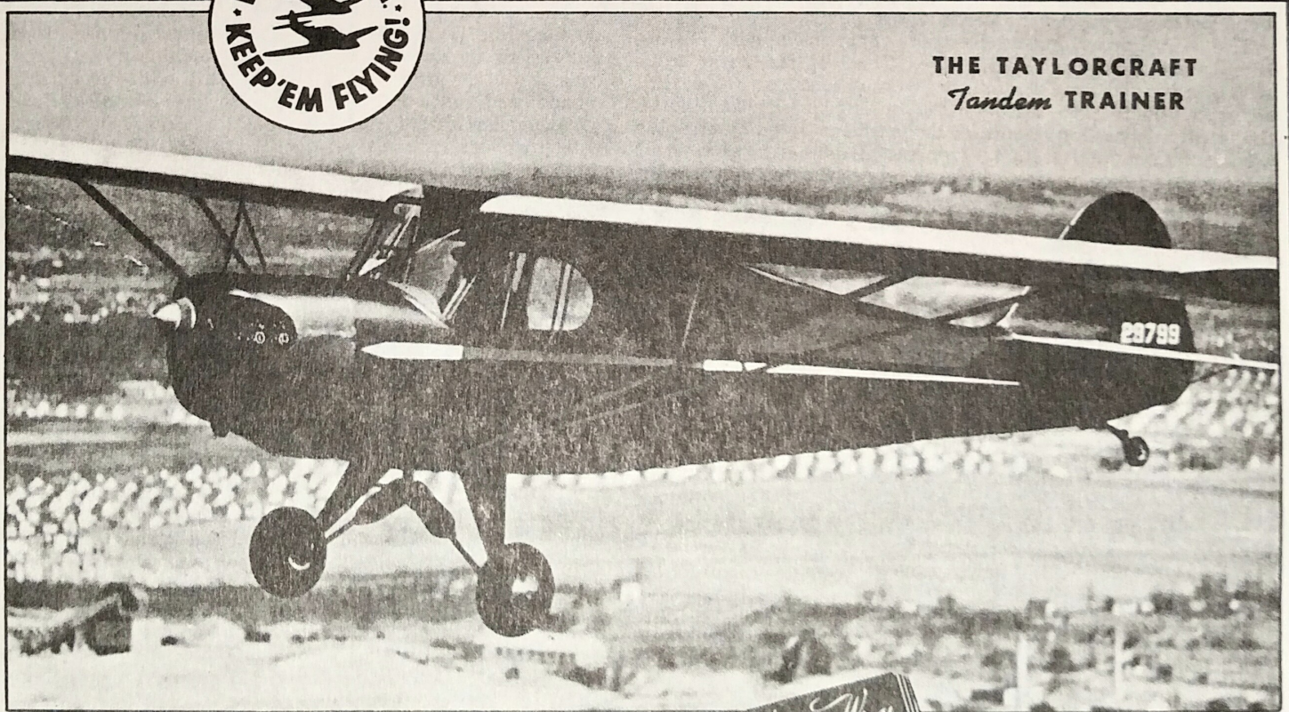
THE TAYLORCRAFT Tandem TRAINER

TAYLORCRAFT AVIATION CORP. Dept. 84, ALLIANCE, OHIO EXPORT: FAIRCHILD AVIATION CORP. Jamaica, L. I., New York, U. S. A.